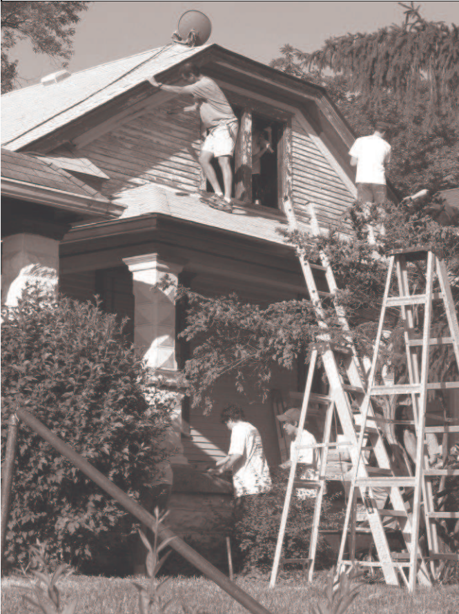
Knights in action at Repair Affair on June 17